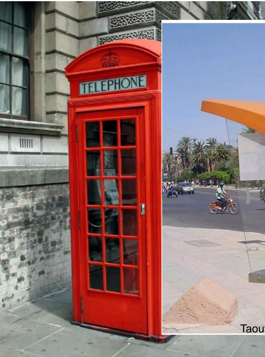
British phone box