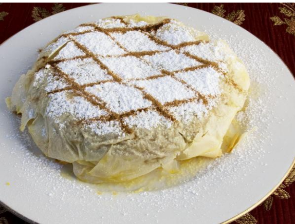
Basteela Taoufik Cherkaoui

If you went into a restaurant in Morocco and asked for “basteela”, what would you get?