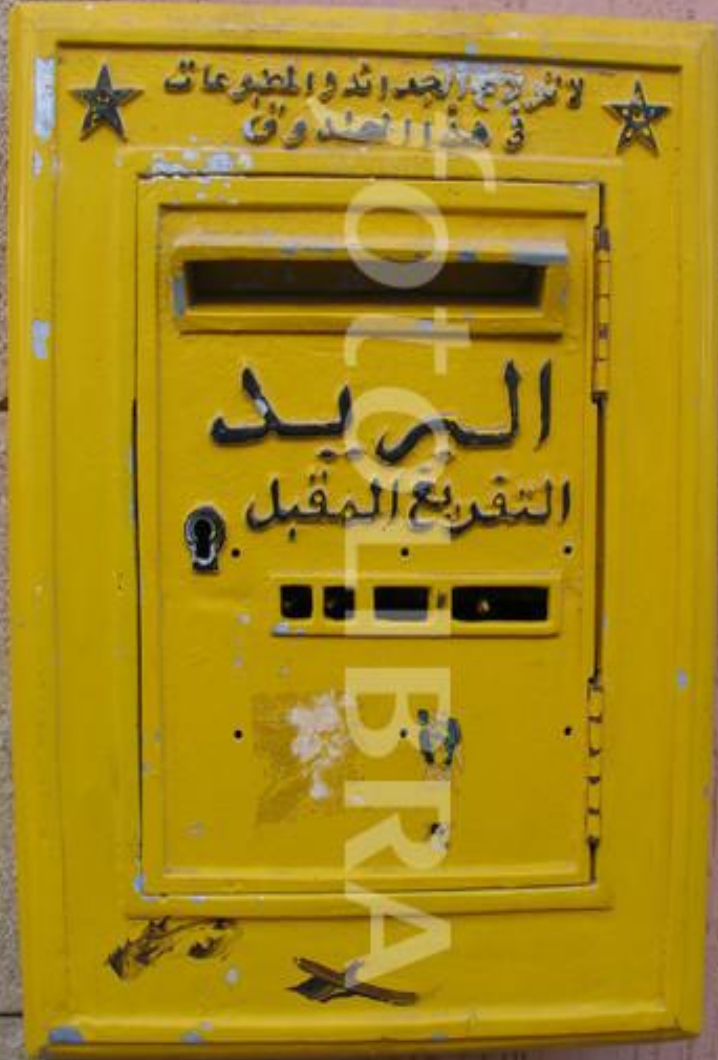
Arabic post box